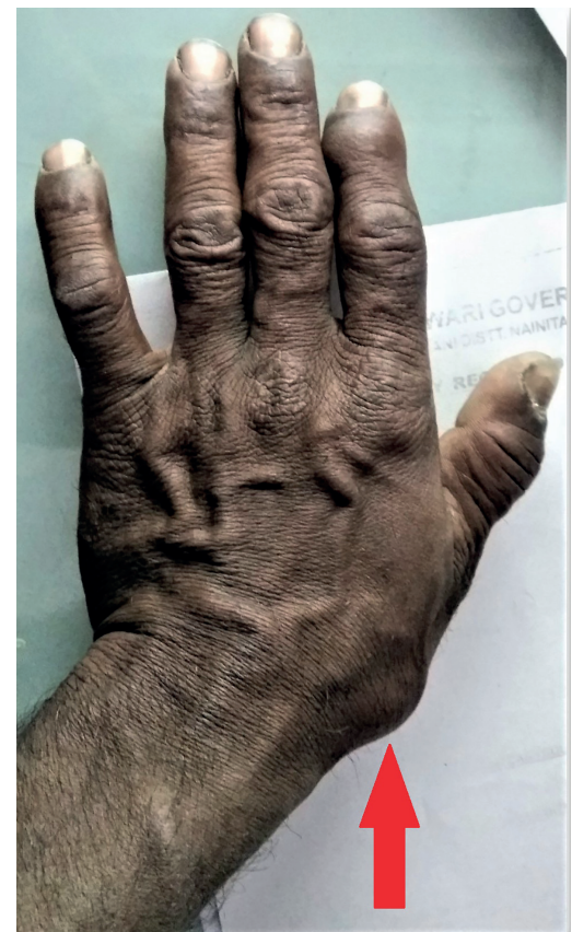
Figure 1. The clinical image of the left hand showing the swollen base of thumb and deformity (shown by arrow).

Neuropathic arthropathy or Charcot joint is a disabling clinical condition resulting from various causes, such as diabetes, syphilis, cerebral palsy, and spinal cord injury or its malformations. Joint destruction following an abnormal sensory ability results in aberrant response to stress and osteoclastic activity leading to varying grades of arthritis or deformities. 1 Usually large joints and, thus, weight bearing are affected with this condition, and cervical spine syringomyelia is an uncommon cause of neuropathic arthropathy. The syringomyelia caused by basilar impression leading to