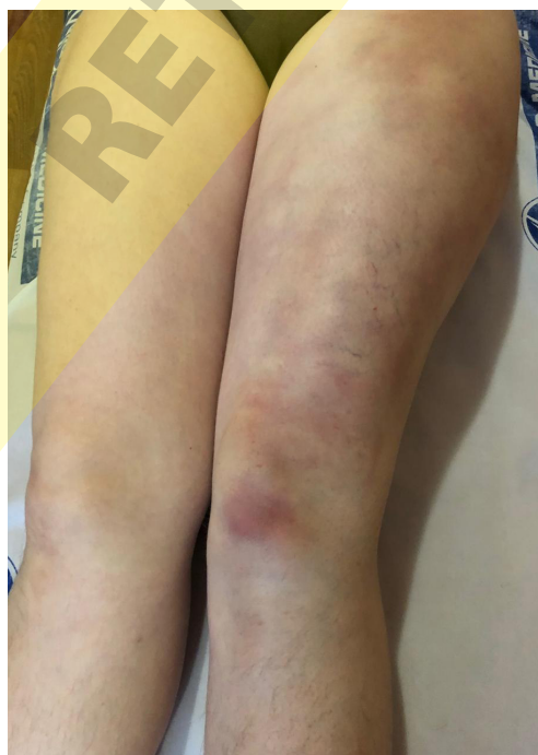
Figure 1. The appearance of the patient's skin integument at the time of consultation with the rheumatologist.