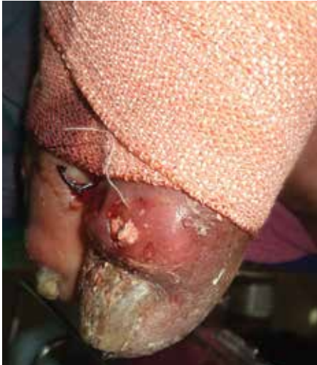
Figure 4. Extrusion of gouty material from lesion over right great toe

of urate crystals in the tissue and/or synovial fluid of an inflamed joint (1). Patients presenting with gout often have co-morbidities such as hypertension, obesity, diabetes, chronic kid-