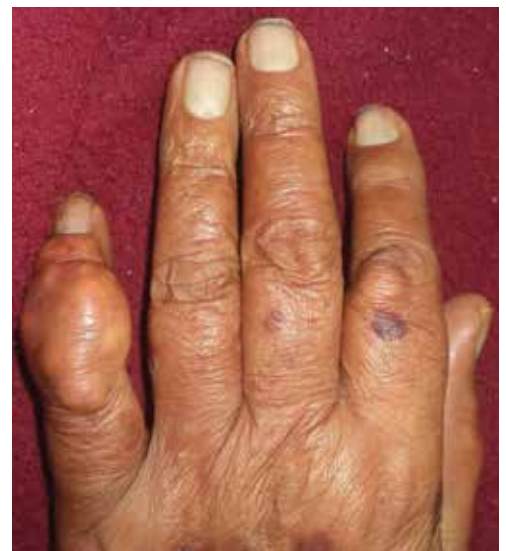
Figure 2. Gouty tophi over left little finger