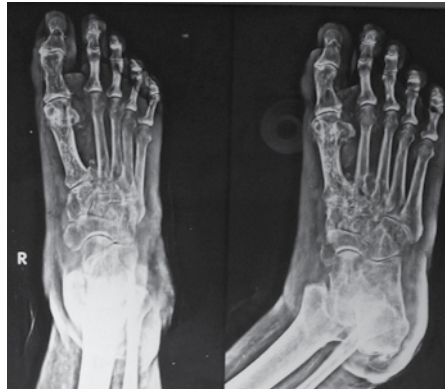
Figure 5. X-ray of right foot showing osteolysis with trabecular pattern

of urate crystals in the tissue and/or synovial fluid of an inflamed joint (1). Patients presenting with gout often have co-morbidities such as hypertension, obesity, diabetes, chronic kid-