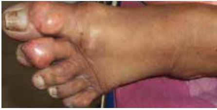
Figure 3. Podagra of left foot and gout tophi over left 2 nd and 3 rd toe