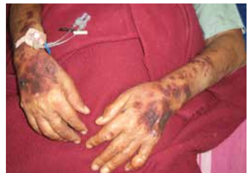
Figure 1. Purpuric lesions over both forearms

Gout is one of the most common debilitating types of arthritis, mostly present in males and postmenopausal females; it is characterized by increased serum uric acid levels (more than 6.8 mg/dL at 37°C, pH 7.4) and the deposition of monosodium urate crystals in and around the joints (1, 2). If this hyperuricemic stage persists for a long duration without treatment, gouty tophi develop and get deposited around joints, particularly the 1 st metatarsophalangeal joint (podagra), and eventually damage the involved joint (1, 2). As most uric acid gets excreted through the kidney, any renal insufficiency that predisposes the patient to the development of gout and chronic hyperuricemia can also cause renal injury (1). Because our patient was suffering from chronic HTN, he was likely to have some degree of renal impairment, which was further worsened by preuremic (cellulitis-induced) AKI, leading to the development and aggravation of gout. Because the patient was taking anticoagulants, he developed iatrogenic purpuric lesions, which were possibly worsened by AKI and alcoholism (3). The gold standard for the diagnosis of gout is the identification