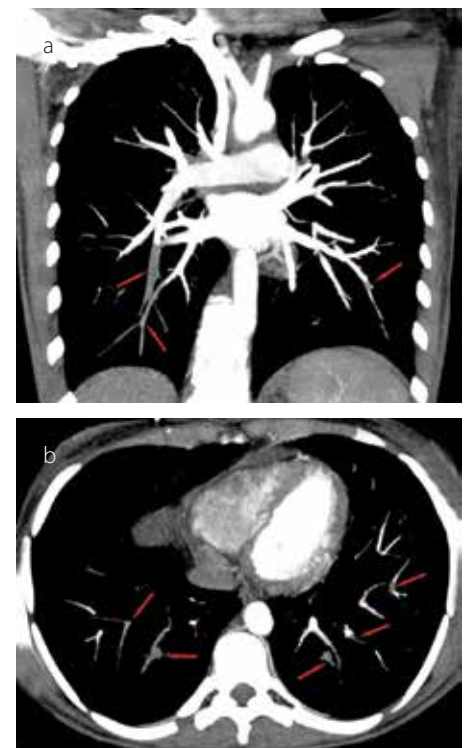
Figure 3 a, b. Coronal (a) and axial (b) CT images show thromboses in the subsegmental branches of the pulmonary artery.