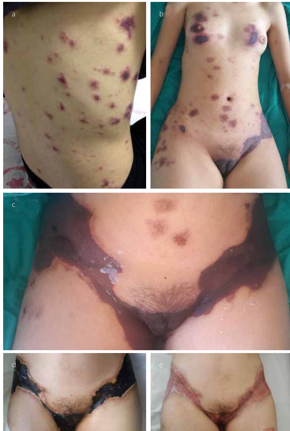
Figure 1 a-e. Skin lesions on the chest and back on hospital admission (a). A day after admission, new painful necrotic skin lesions appeared on the left inguinal and genital areas (b). Two days after admission, new necrotic lesions in the right inguinal area were observed (c). Thirty days after admission, before debridement of necrotic areas in the inguinal area and skin graft (d). Four months after admission, after debridement and skin graft (e).

laboratory parameters were observed after the administration of corticosteroids, IVIg, and plasmapheresis. Skin lesions, except in the inguinal area, completely regressed. Corticosteroid therapy was tapered, and hydroxychloroquine was added. Forty days after the CAPS attack, debridement of necrotic areas in the inguinal area and skin graft were performed. Hydroxychloroquine, methylprednisolone at a dose of 16 mg/day, and low-molecular-weight heparin (LMWH) were continued during surgery. Skin lesions on the