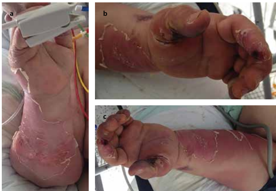
Figure 1. a-c. The palmar region of the left hand showed necrotic lesions and eroded areas with hemorrhagic crusts especially prominent on the finger tips and first finger extending to the dorsum of the finger and causing a circumscribed eroded area. The flexor forearm showed desquamation on both sides with adjacent apparent erythema and induration on the left side